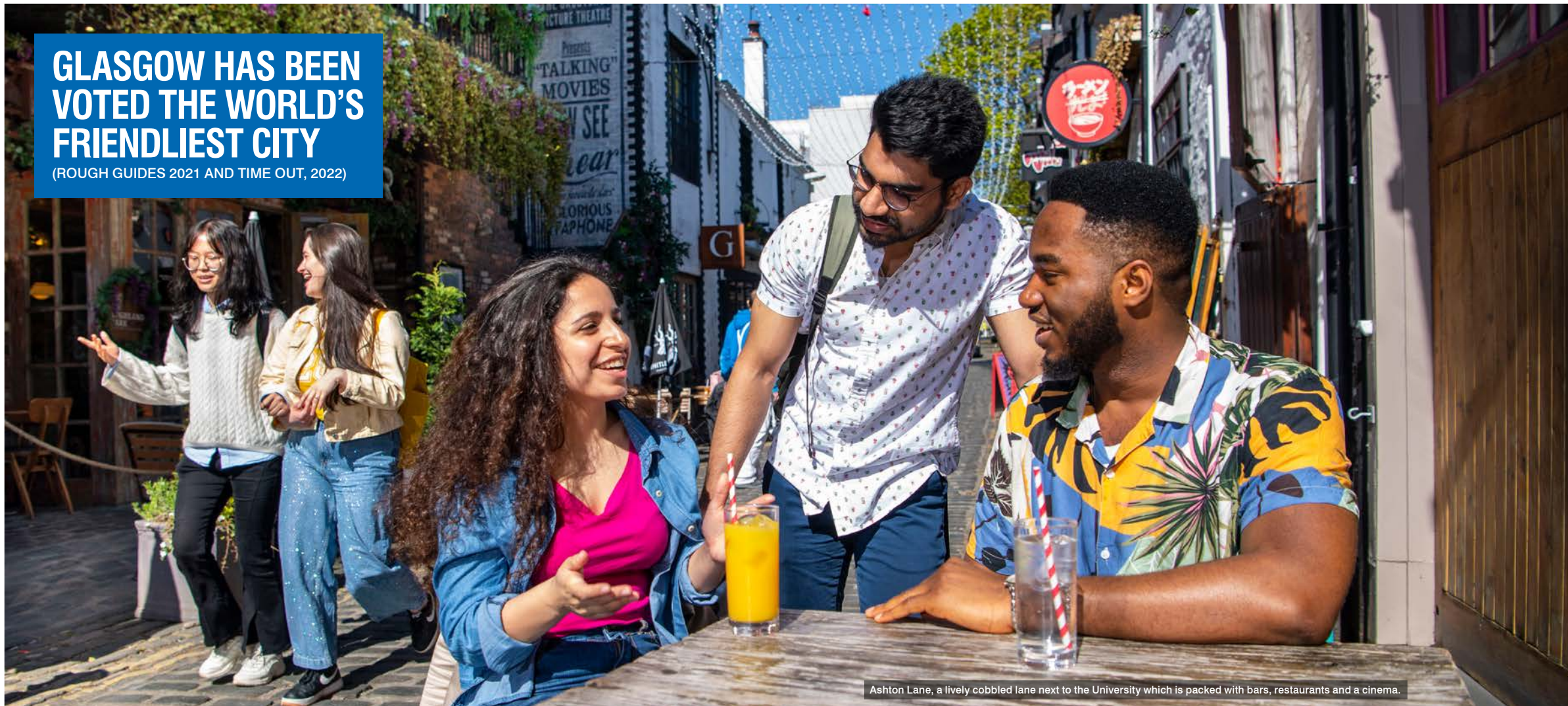
Ashton Lane, a lively cobbled lane next to the University which is packed with bars, restaurants and a cinema.