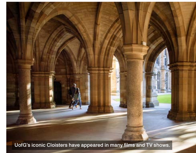
UofG's iconic Cloisters have appeared in many films and TV shows.

A range of teaching methods help you develop your skills, knowledge and experience.