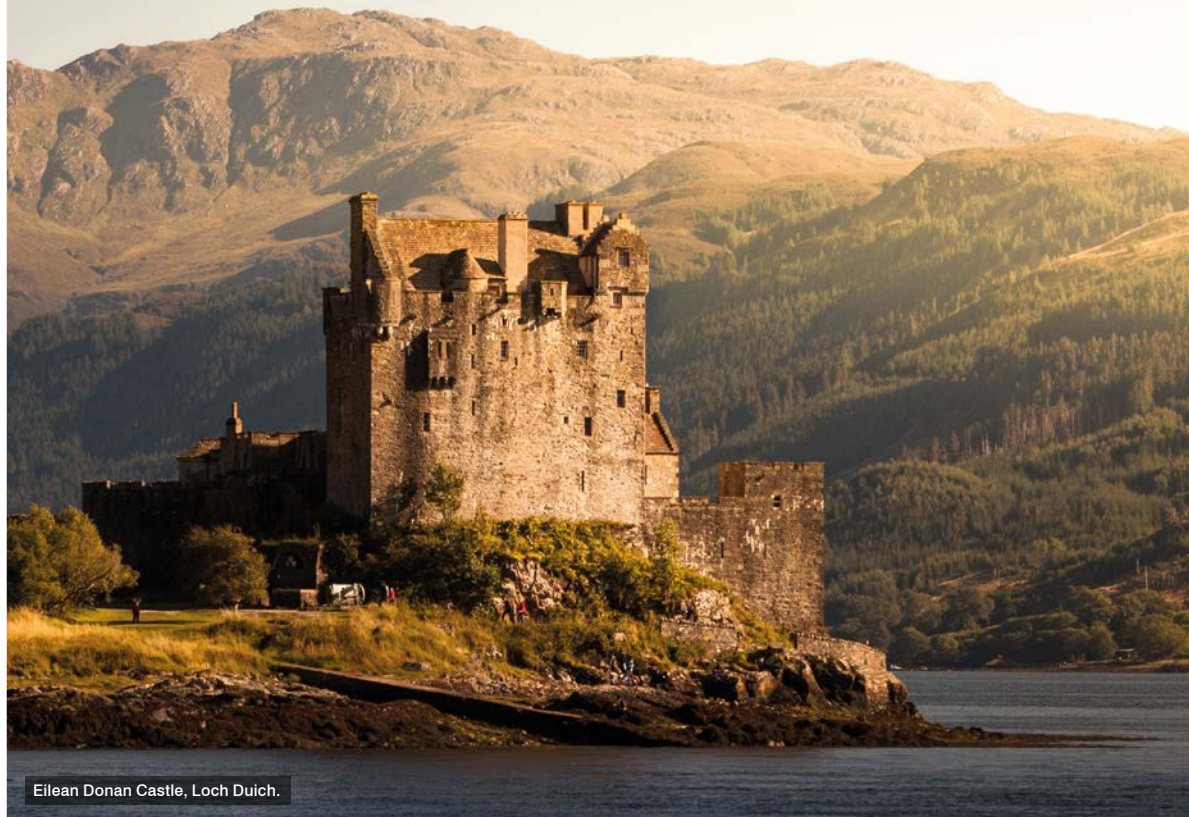
Eilean Donan Castle, Loch Dulich.