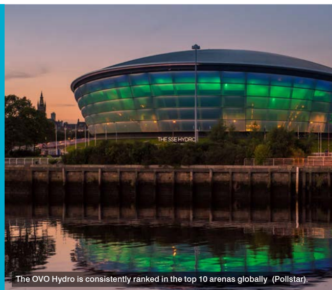
The OVO Hydro is consistently ranked in the top 10 arenas globally (Pollstar).

Glasgow has an ever-evolving food and drink scene, with options to suit all tastes and pockets. The Finnieston neighbourhood (next to the University) is considered the city's "foodie quarter" with a brilliant mix of cool, quality and affordable venues.