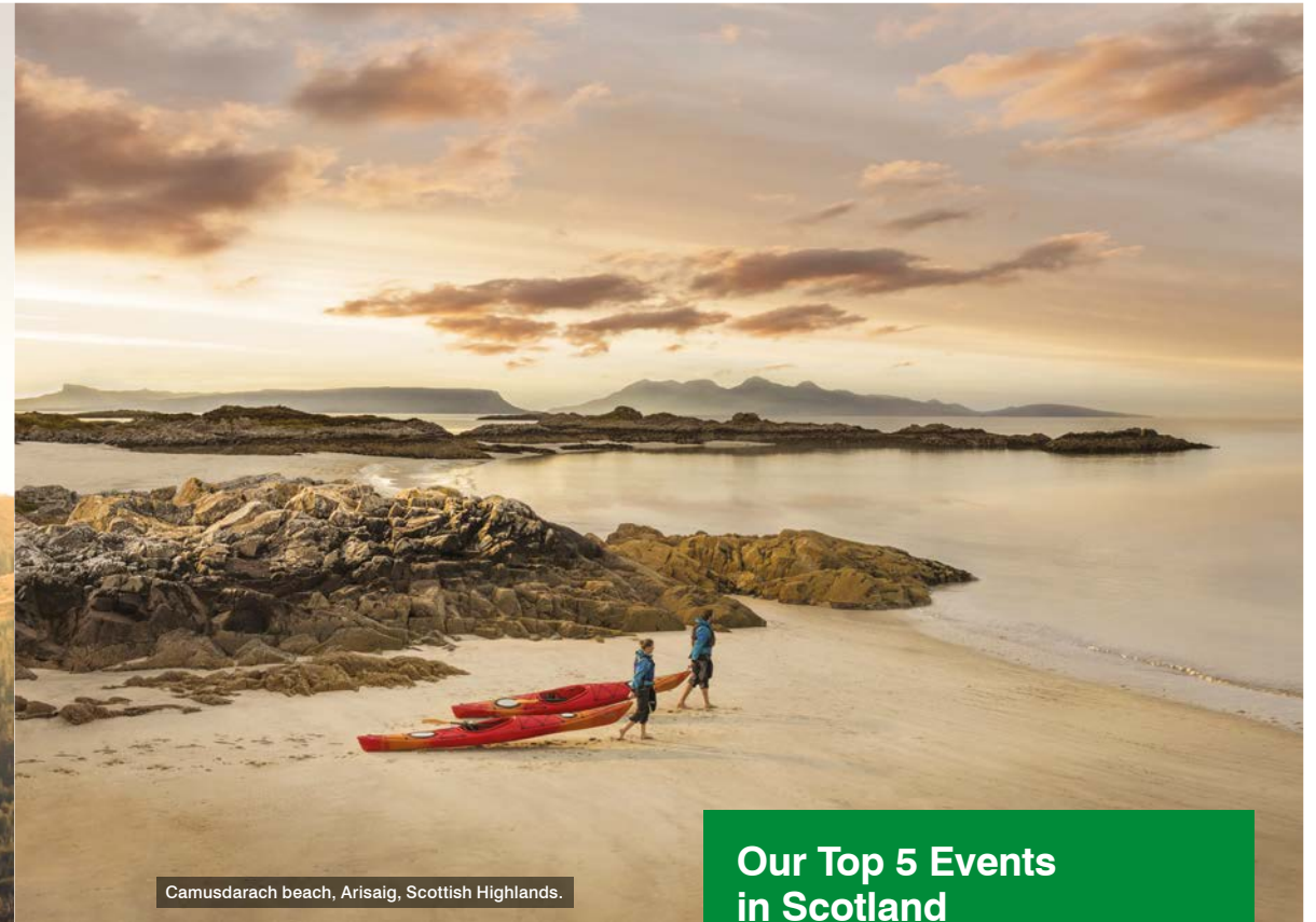
Camusdarach beach, Arisaig, Scottish Highlands.