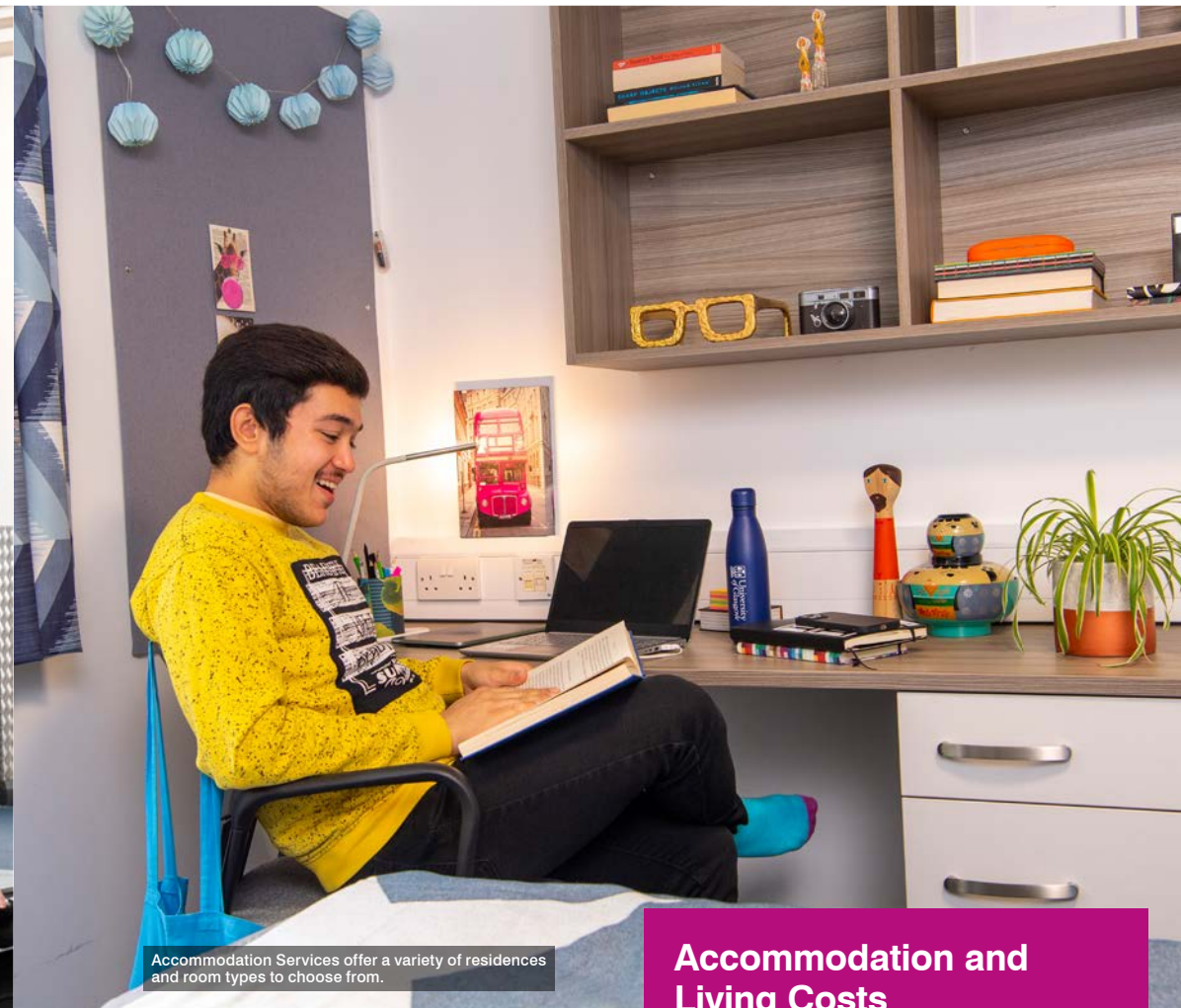
Accommodation Services offer a variety of residences and room types to choose from.