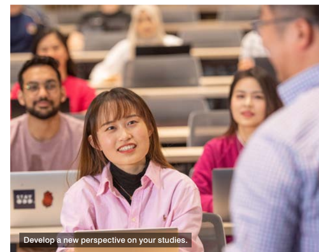
Develop a new perspective on your studies.