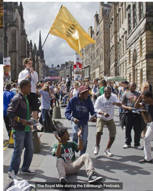
The Royal Mile during the Edinburgh Festivals.

Scotland has played a starring role on the big and small screen, as the filming location for top films and TV shows including Outlaw King , 1917 , Skyfall , Harry Potter and The Batman . In fact, the University itself is frequently used as a filming location and has featured in several episodes of Outlander . See visitscotland.com .